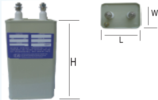
Type Rectangular Case